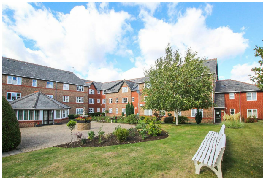
41 Queenswood House Eastfield Road, Brentwood, CM14 4HF

TOTAL APPROX. FLOOR AREA 556 SQ.FT. (51.7 SQ.M.) THIS PLAN IS FOR ROOM IDENTIFICATION ONLY, AND ITS ACCURACY IS NOT GUARANTEED. www.epcsinsex.co.uk Made with Metropix ©2019